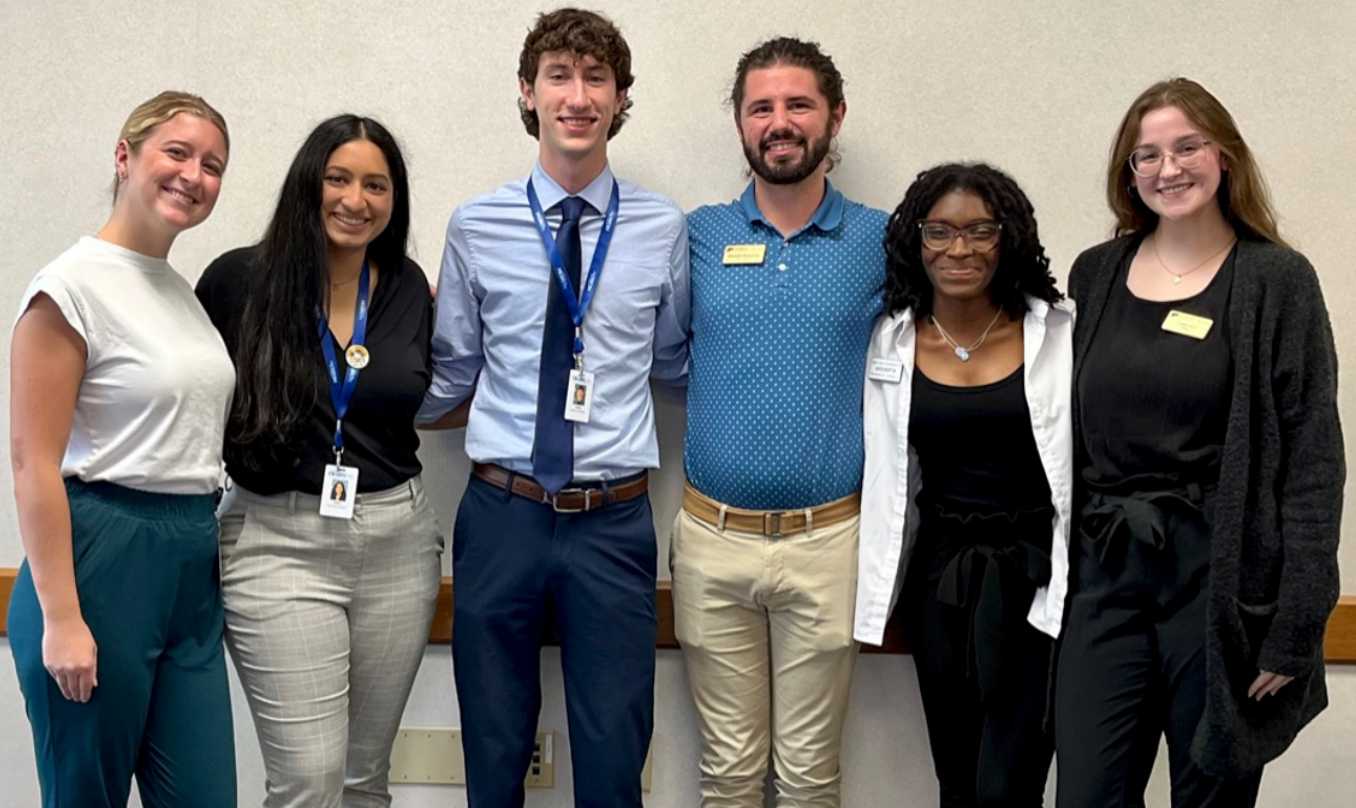
Purdue University PGY1 Pharmacy Residents at the August 2023 IPTEC Conference