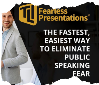
Fearless Presentations cover graphic

Watch this under four minute video by ASHP to hear how pharmacy students can benefit your practice site! This video highlights utilizing pharmacy students as a tool to provide top-notch patient care.