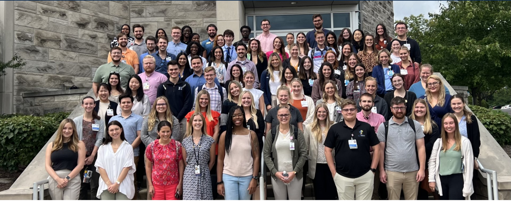
IPTeC participants at the 2023 IPTeC Conference in August

THE LATEST NEWS AND UPDATES FROM YOUR LIAISONS AND EXECUTIVE COMMITTEE