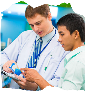
Pharmacist and student reviewing a medication

We believe building perspective is important, so here are some voices and experiences we want to amplify this month. We encourage you to engage with one, if not all, of these options the next time you have some time to fill!