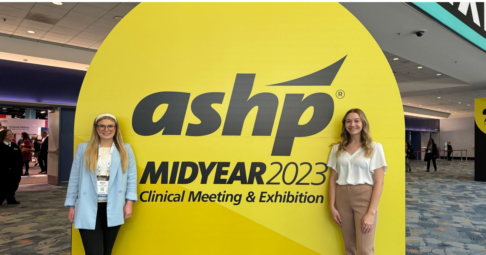
Riverview Health Residents at ASHP Midyear 2023