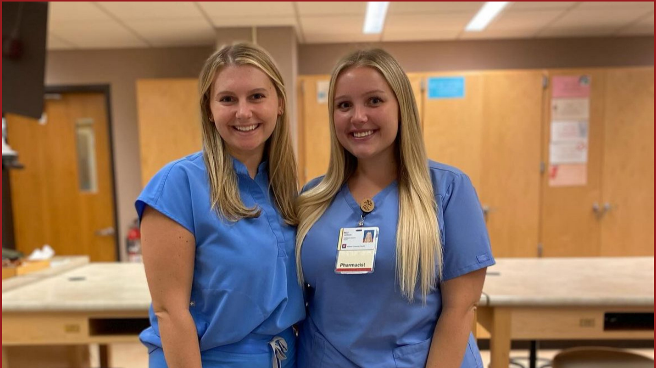
IUH Arnett PGY1 Residents helping out in the Purdue University Skills Laboratory