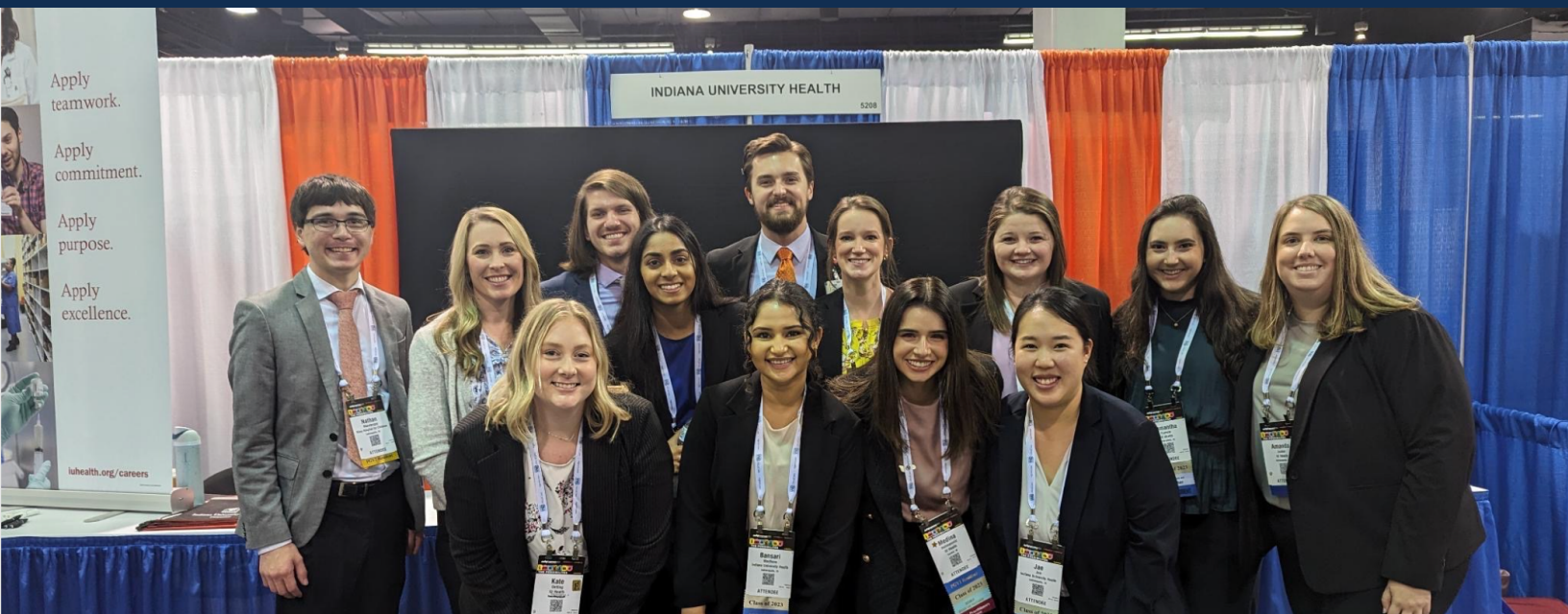
Indiana University Health - AHC Pharmacy Residents at ASHP Midyear

THE LATEST NEWS AND UPDATES FROM YOUR LIAISONS AND EXECUTIVE COMMITTEE