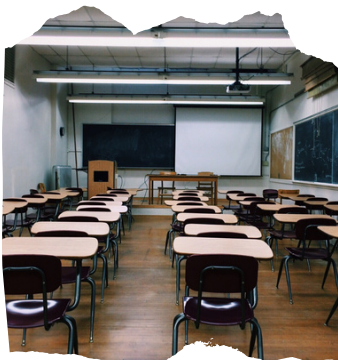
Primary school classroom

NIOSH and the Dr. Lorna Breen Heroes' Foundation recently released the Impact Wellbeing Guide, which provides hospital leadership with step-by-step guidance to make operational changes that improve healthcare worker wellbeing within their hospitals.