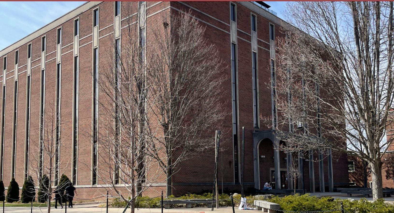
Purdue University College of Pharmacy