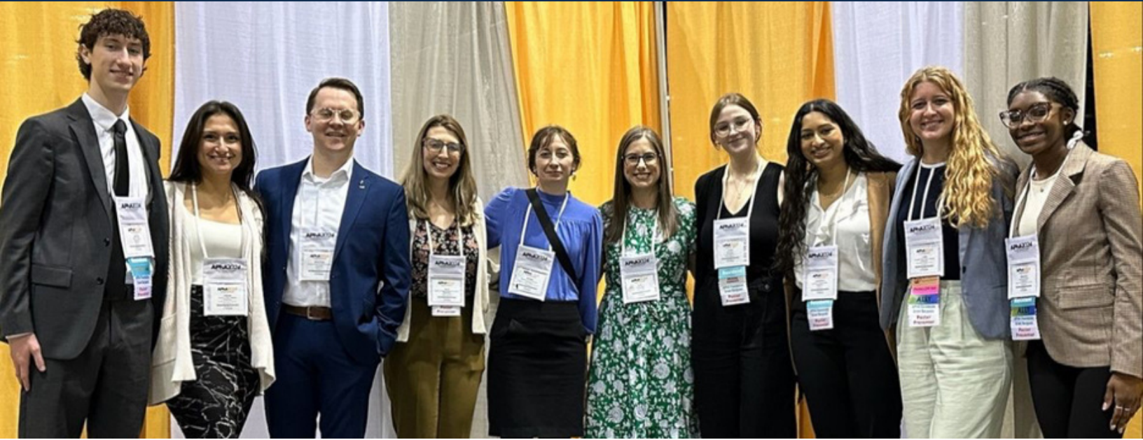
IPTeC participants and mentors at APhA Annual Meeting in Orlando, FL

THE LATEST NEWS AND UPDATES FROM YOUR LIAISONS AND EXECUTIVE COMMITTEE