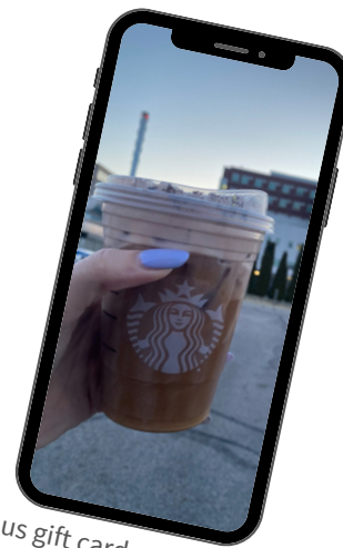
Previous gift card winner, Grace Carpenter's Starbucks prize

Click the image or the link below to play IPTeC's pharmacology version of Connections®.