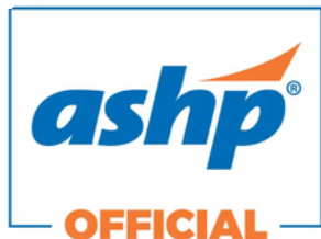
ASHP Official Podcast Logo

Get to know the science behind what causes the stiff, creaky joints of the most common forms of arthritis and what you can do to prevent it. Watch this short TED-Ed discussing a condition that affects over 90 million people in the U.S. alone.