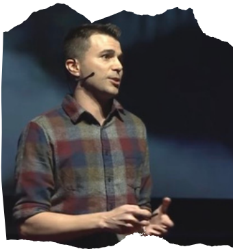
Mark Rober presenting a TEDTalk.

We believe building perspective is important, so here are some voices and experiences we want to amplify this month. We encourage you to engage with one, if not all, of these options the next time you have some time to fill!