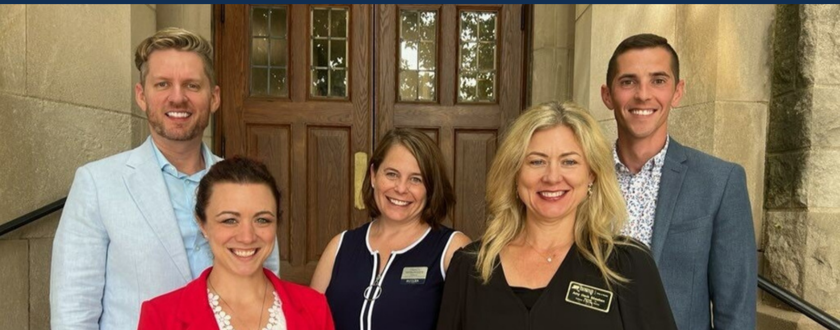
IPTEC executive committee members photographed at Butler University.

THE LATEST NEWS AND UPDATES FROM YOUR LIAISONS AND EXECUTIVE COMMITTEE