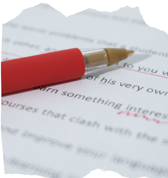
A red pen laying on a paper.

We all use videos in teaching, but passively consuming videos doesn't encourage long term learning. Take a listen to ponder the question: How do we make the most of videos as a teaching resource?